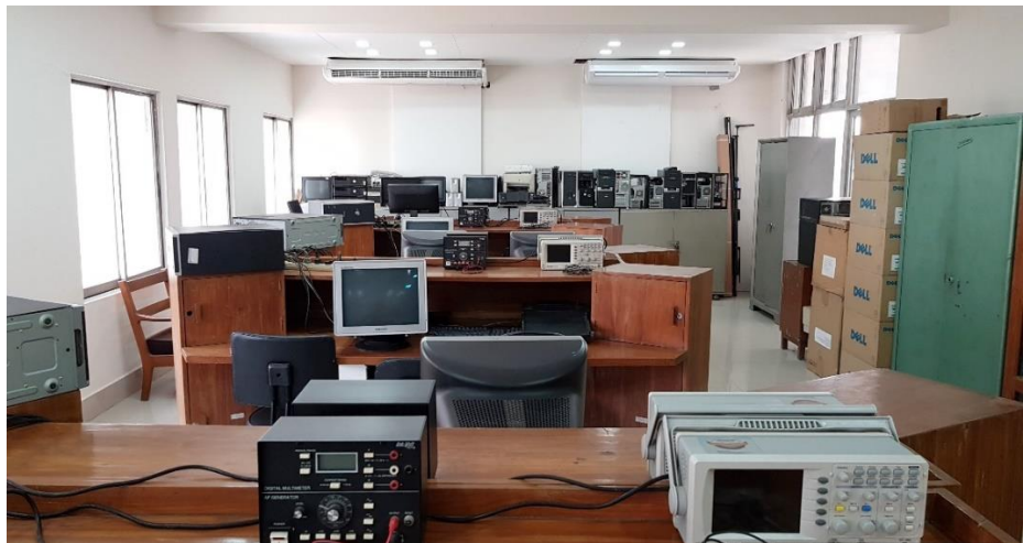
Communication Engineering Lab